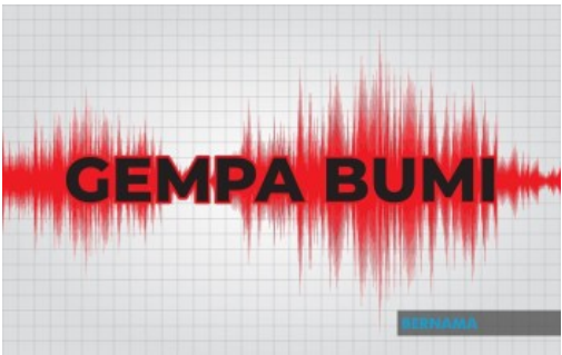
Weak earthquake detected in Sulawesi Sea

Wisma BERNAMA No.28 Jalan BERNAMA Off Jalan Tun Razak 50400 Kuala Lumpur Malaysia