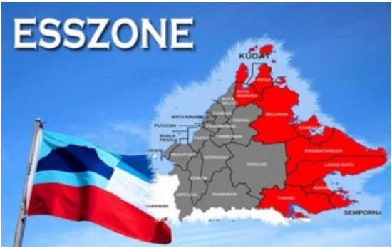
Curfew in waters off ESSZone extended until Feb 14

‘Sense Of Belonging’ Feeling Lacking Among City Denizens